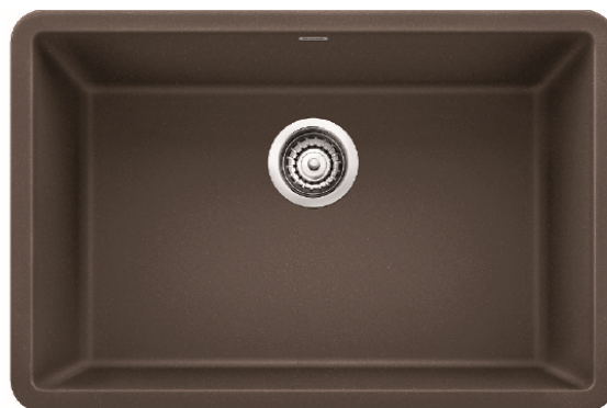
Model 522433 shown